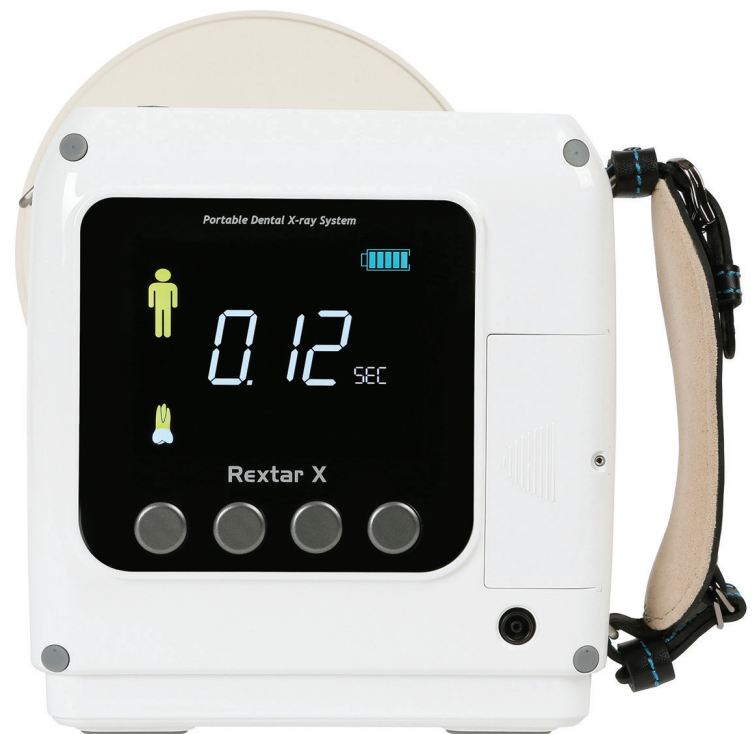
Largest LCD Display Screen